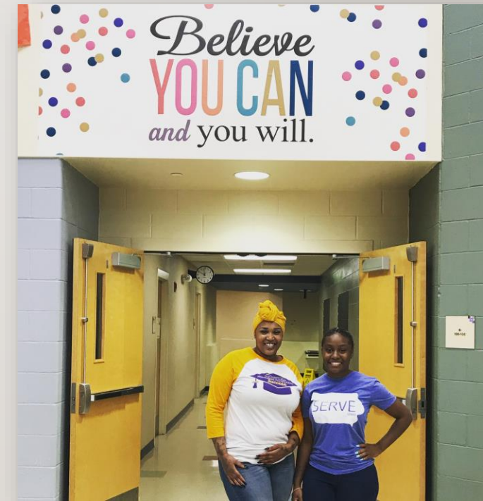
2018 Summer VISTA members Waterloo Community School District.